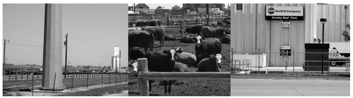
Fig. 5. Feedlots and the Swift & Company Plant

First, it has to be acknowledged that to reclaim the landscape of the Front Range, it will be necessary to transform the productive landscape of the food system. This does not mean that the scope of the transformation is outside the purview of the design profession. The working landscape is not un-designed, but terrain in which form is predominantly determined by economies; this could be said of most of our landscapes. The detachment of the public from agricultural territory, through reduced legibility, distancing of production processes from the communities in which they are situated, and restructuring environmental processes as a means to an end in production, has opened an abyss between the landscape Americans inhabit in their minds and the territory in which they live their lives. Communities cannot fight for restitution of a landscape they cannot recognize as lost. Demonizing the existing landscape of beef cannot instigate more sustainable practices; environmental rhetoric cannot overpower core ideas of American landscape that situate Americans as unique in their ability to adapt to the challenges of the territory - to make it productive – and a belief in their preordained