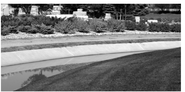
Fig. 4. Former irrigation ditch at Centerra's retail mall entrance

Five miles from Loveland, near the Route 25 exit, grows Centerra, billing itself on its website as "a 3,000 acre state-of-the-art, multi-use development centrally located at the foot of the Rocky Mountains in Loveland, Colorado. Centerra's master-planned community ensures excellence in business and an exceptional quality of life...Discover the heart of Northern Colorado." So far this has played out in the landscape as: a mall for outlet and luxury goods; a mall of fast food and chain restaurants; a corporate office park, a series of residential subdivisions (5100 units) with vaguely rusticated "Rockies" style homes on a variety of lot sizes; and the promise of a High Plains Environmental Center. development rhetoric takes advantage of the popularity of environmental issues and frames its product accordingly. The guiding principles are advertised as: "Heritage, Ecological Stewardship, Responsible Land Planning, Healthy Livable Community, Economic and Social Vitality, Neighborhoods of Lasting Value, Architecture, Environmentally-Authentic Responsive Building, Life-Long Learning".